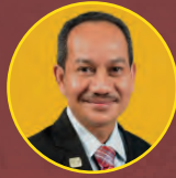
MODERATOR Suhardi bin Alias National Sports Commissioner

3.00 p.m. – 4.00 p.m. Session 3 - A Candid Conversation: Malaysia's Path to Becoming a Capital for Global Sports Dispute Resolution