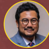
Dato' Sri Megat D. Shahrman bin Dato' Zaharudin Paralympic Council Malaysia